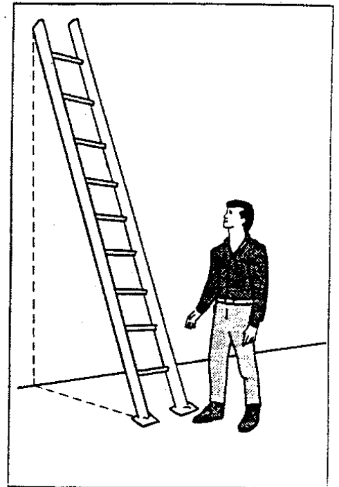
Use the 4-1 rule for ladder safety—set the base of the ladder 1 foot away from the wall for every 4 feet of ladder height.