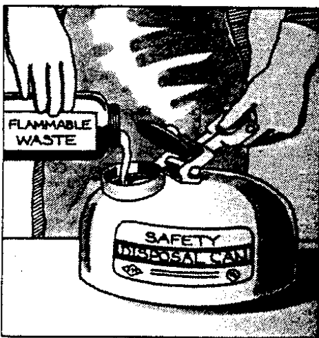
Dispose of flammables in approved containers.

Each flammable is different, although most evaporate quickly. Some explode when they are near even tiny sparks. Some explode simply on contact with air. When you read the MSDS, you'll know just how to work with the particular chemical.