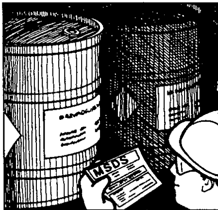
Labels and MSDSs list procedures for handling solvents safely.

You can irritate or damage skin, eyes, lungs, and other organs if you absorb too much of a toxic solvent. Permissible Exposure Limits (PELs) for many solvents have been